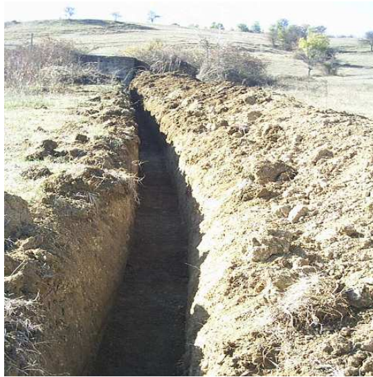
Figure 2 : Location for the construction of a new reservoir, in the village Izvor

The main project activities will include: a) marking out the construction site and b) construction of the water reservoir and maintenance during operational phase. The construction works are mainly focused on: excavation of the trench, construction works, concrete works, laying the water pipelines, insulation works and installing the reinforced concrete manholes. The inlet pipe from the reservoir to the village has a length of 281m diameter ND 110 and NP working pressure 10 bar.