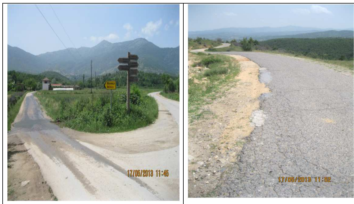
Figure 1: The present condition of the local road subject to this appraisal in Caska

Municipality is making systematic efforts to improve the road infrastructure and provide asphaltting of new local roads, but its financial capacity is limited. Main activities in this respect for last two years are presented in table 8. Reconstruction of local roads is financed with own funds and transfers from Agency on State Roads.